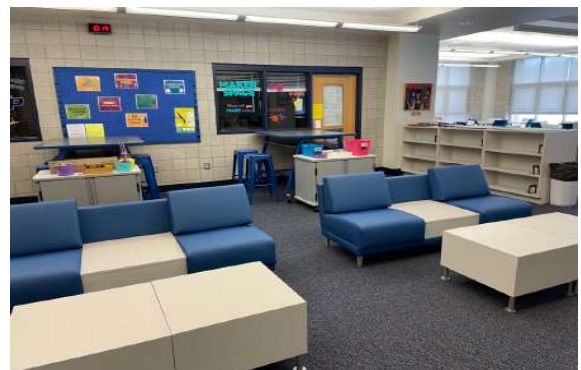
Students can choose from a variety of seating options