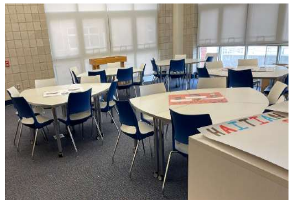
The classroom area encourages students to work together

Overall, the library renovations have definitely made a positive impact on the high school and have helped students in many different ways. While the library is closed 11th period, you can check out the library during your study hall or in lunches 5 or .