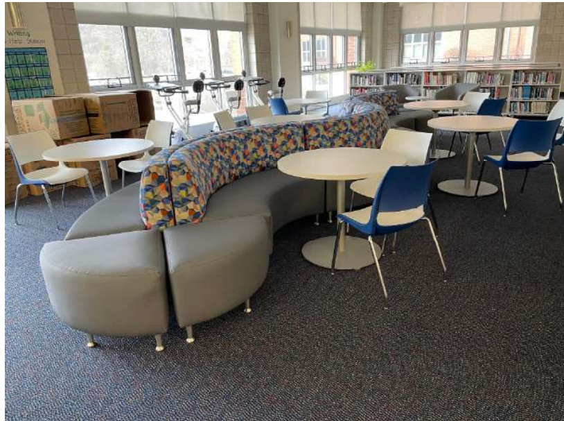
The new couch is colorful and is the perfect spot to curl up with a book

Maybe some of you have noticed the renovations in the library. Have you seen the new booths? The big double-sided couch? The lower shelves? All of these and even more are available in the newly renovated space in the library.